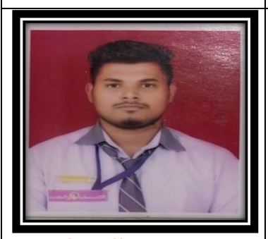
P.G.- STUDENT & PRIVET JOB