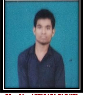
P. G- STUDENT