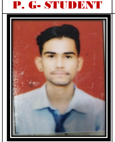
P. G- STUDENT